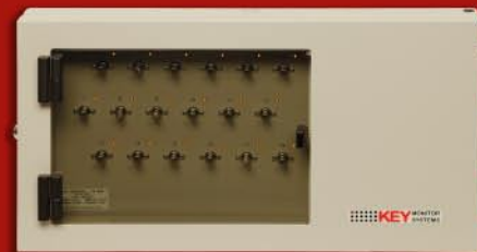
KM18S - SLAVE UNIT 640 (w) 335 (h) x 106 (d) mm