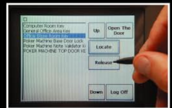
Only user unique list of keys displayed