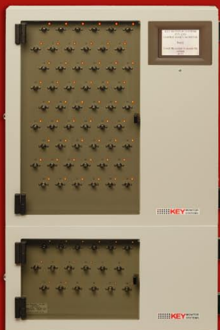
KM 54C with KM18S COMBINATION