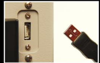
USB connection available