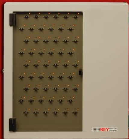
KM 54S - SLAVE UNIT 640 (w) 725 (h) x 106 (d) mm