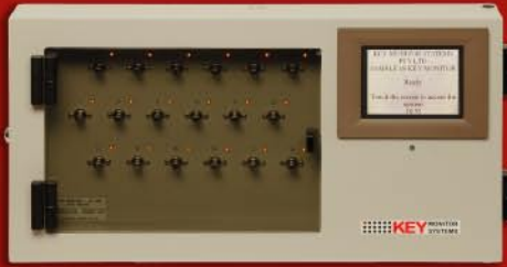
KM18C - MAIN CONSOLE 640 (w) 335 (h) x 106 (d) mm