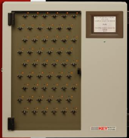
KM 54C - MAIN CONSOLE