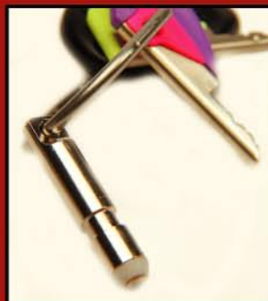
Unique electronically coded key carrier secured in cabinet