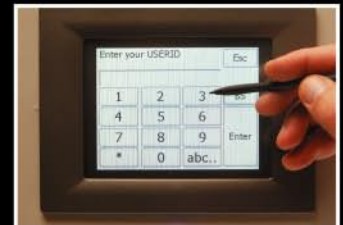
Pin number access to your keys