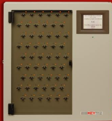
KM 54C - MAIN CONSOLE 640 (w) 725 (h) x 106 (d) mm